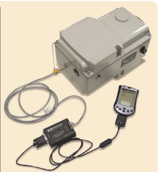
HercuLink Palm Software