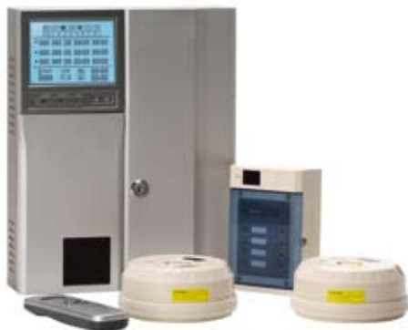
Metro Addressable Gas Detection System

Honeywell Analytics gas detection systems are designed to provide a number of alarm outputs inline with the published exposure limits.