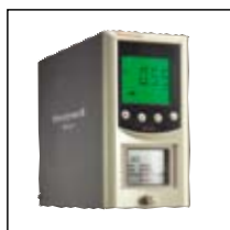
Oxygen (O 2 ) MIDAS-S-O2X