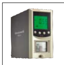
Ozone (O 3 ) MIDAS-E-O3H