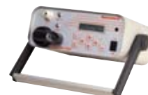
Satellite Portable Gas Detector