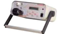
Satellite Portable Gas Detector

Please refer to the specific gas detector's Operational Manual for further details.