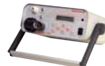
Satellite Portable Gas Detector

Please refer to the specific gas detector's Operational Manual for further details.