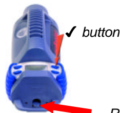
Rear Locking catch