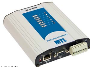
MTL Wireless module

MTL intrinsic safety barriers and isolators can be utilised to enable sensor location in Div 1 / Zone 0 or Zone 1 with installation of the wireless and multiplexer equipment possible in Div 2 / Zone 2.