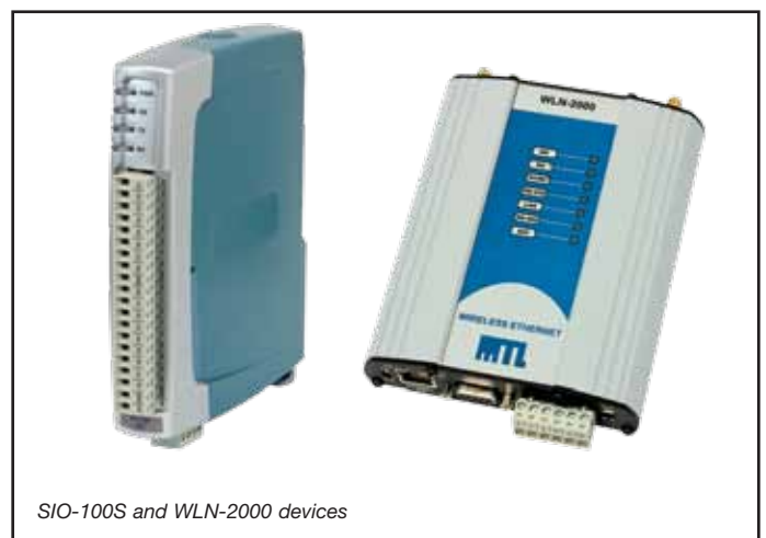
SIO-100S and WLN-2000 devices